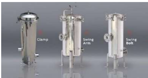
Classic Cartridge Housing