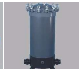
PlasFlow UPVC Cartridge Housing