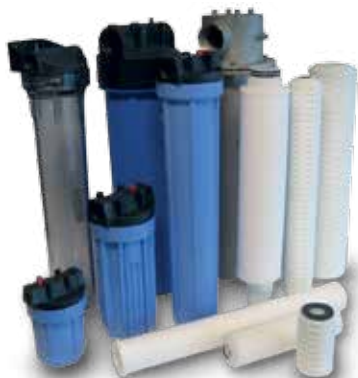
A wide range of filter housings and cartridges for pre-filtration is available.

It is recommended to use filters from the Danfoss filter product range.