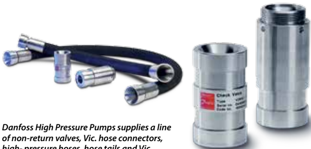
Danfoss High Pressure Pumps supplies a line of non-return valves, Vic. hose connectors, high-pressure hoses, hose tails and Vic. clamps in Duplex.

Capacity: Wide flow range that fits to our pump range.